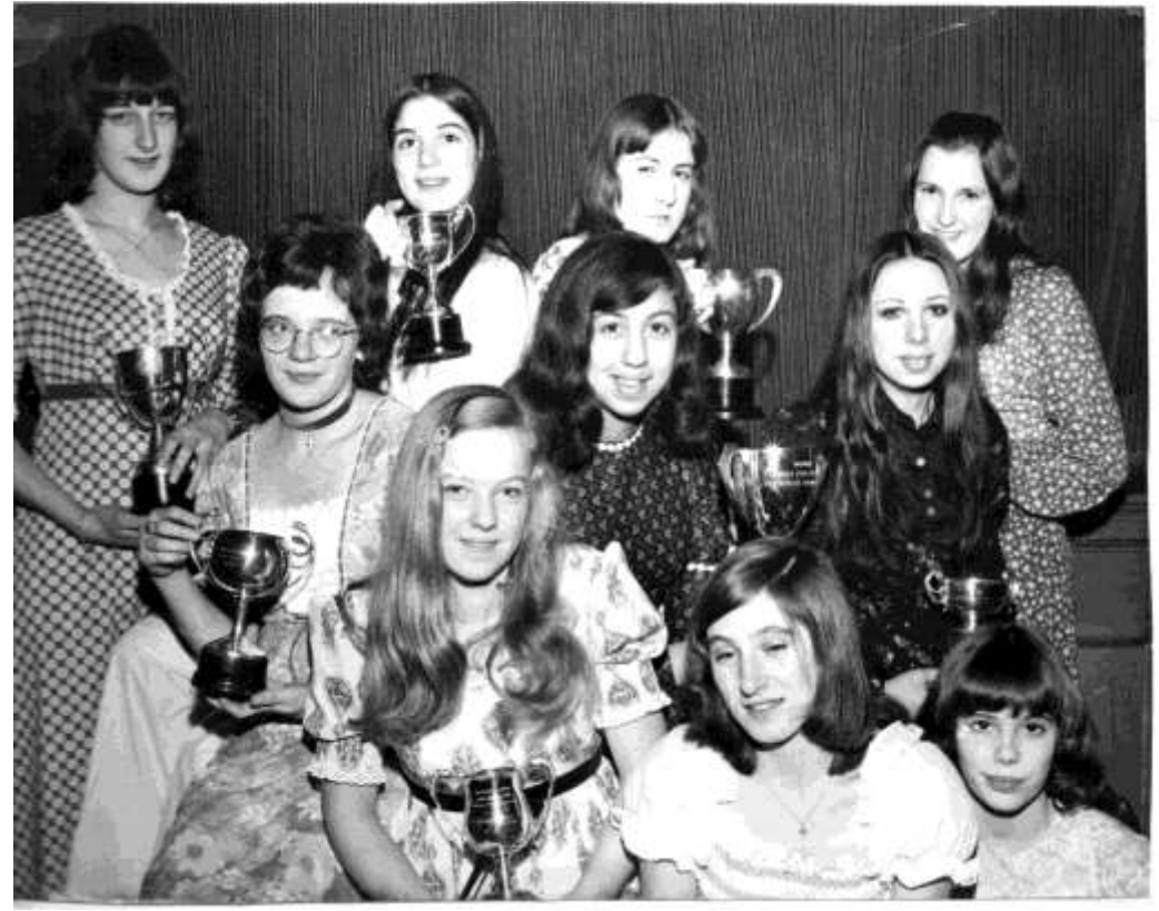
Wigmore Ladies awards presentation from the early 1970s. Can you name them?