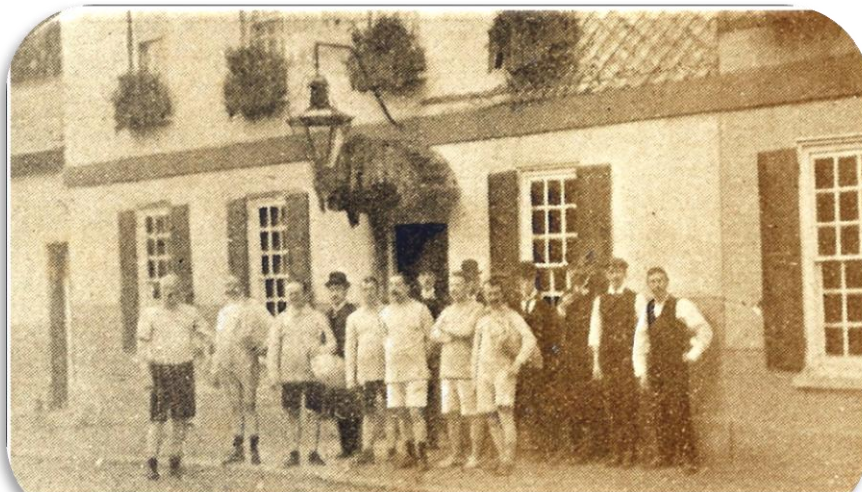
The Trail Layers outside the Swan, West Wickham, prior to the 1904 Mob Match against SLH.

Races have been held every season since 1896, with the exceptions of the war years, apart from 1899, because of fog or frost (depending on which record one reads); 1906, because of a dispute over terms of the contest; and 2001, due to foot and mouth disease. The 1906 dispute is intriguing. There is no reference to it in the SLH Gazettes of the time, though it was reported as close to the event as October that it 'will probably be held on November 3 rd '. It wasn't!